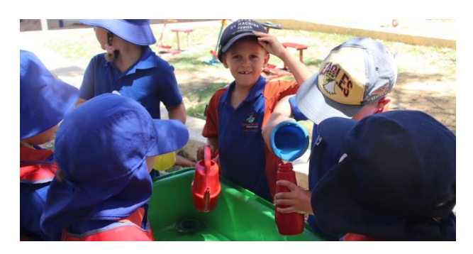
Water play in Pre Primary